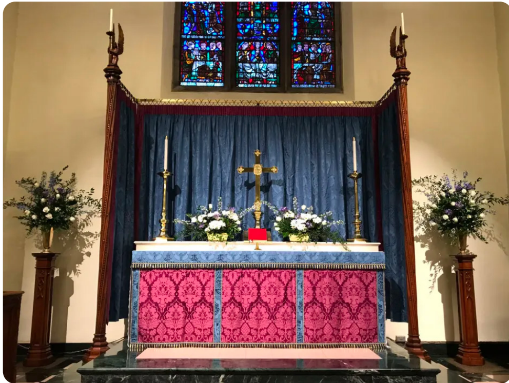
Restored High Altar

On Sunday, November 4, 2018, parishioners encountered the high altar restored to Cram's original vision. All the original pieces were still there and a small committee worked with local craftsmen to move the riddel posts back into their forward position (the holes remained in the marble from where they used to be) and to fashion new curtain rods. The Ecclesiastical Arts Committee chose the fabrics for the new dossal and riddel curtains.